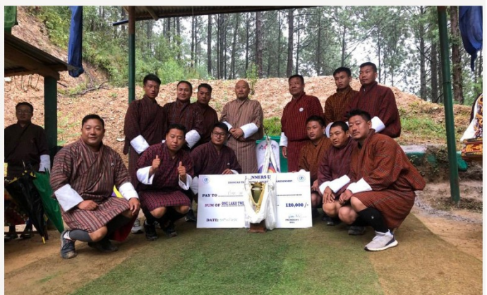
RUNNER-U PBALAM GEWOG B TEAM