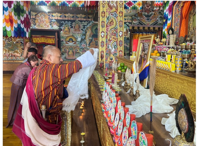
Celebrating 14 th Royal Wedding day