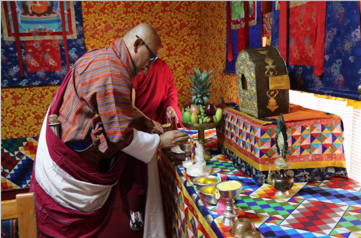
Dzongkhag Tshogdu Thrizin