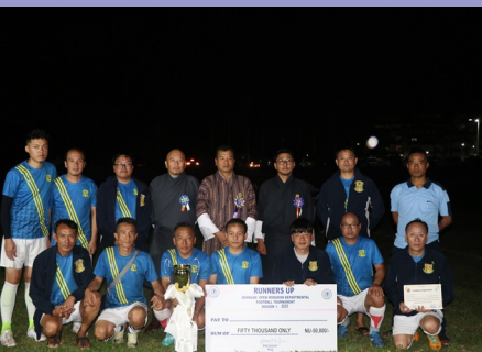
MHSS Giants (Runner-Up)