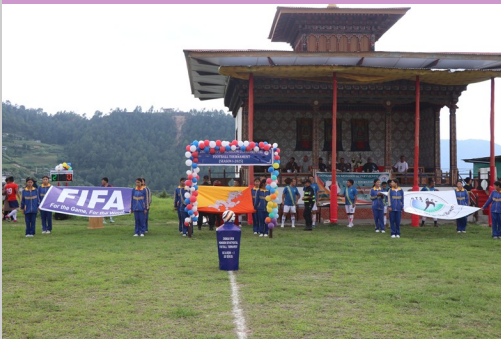
Entry of team with National Flag