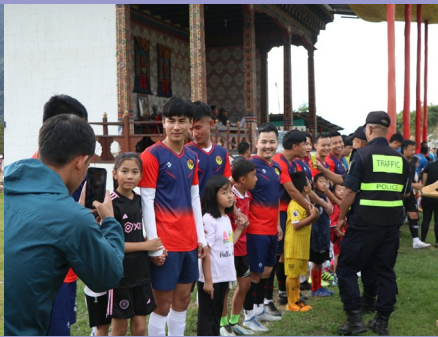
Entry of team with National Flag