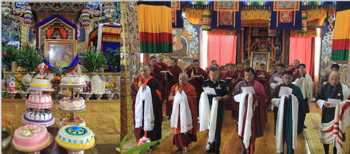
Celebrating 70 th Birth Anniversary of His Holiness the Je Khenpo of Bhutan