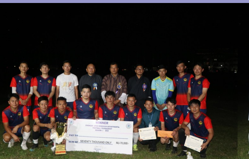
Brothers United (Champion)