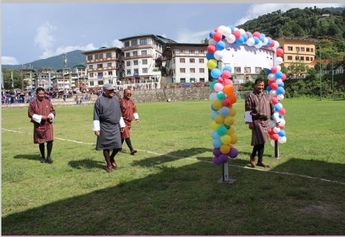
Chief Guest Dasho Dzongdag