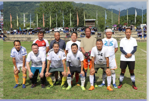
Legends of Regional Heads