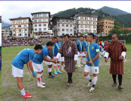
Introduction of Players