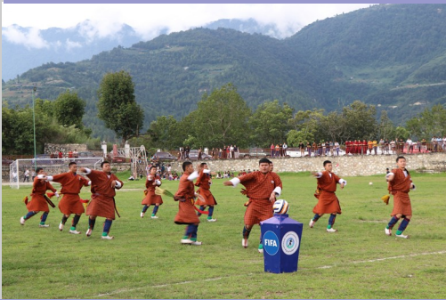
Entry of team with National Flag