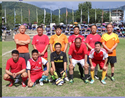
Legends of Dzongkhag