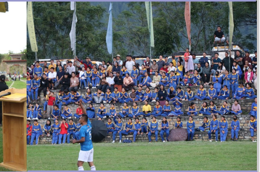
Entry of team with National