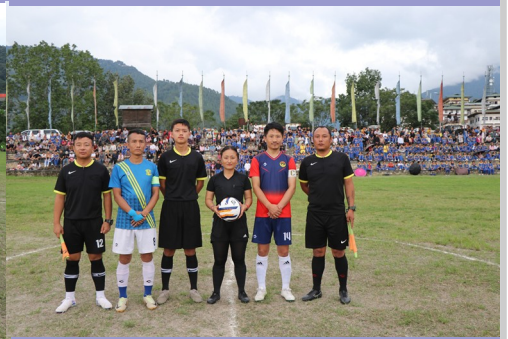
Match Day Officials (Final)