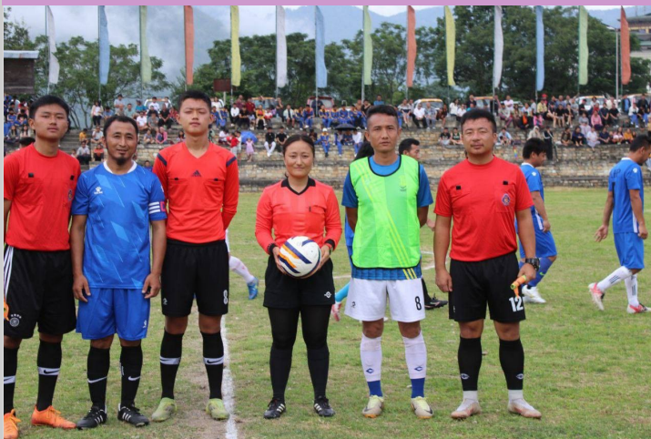
Match Day Officials & Team Captain