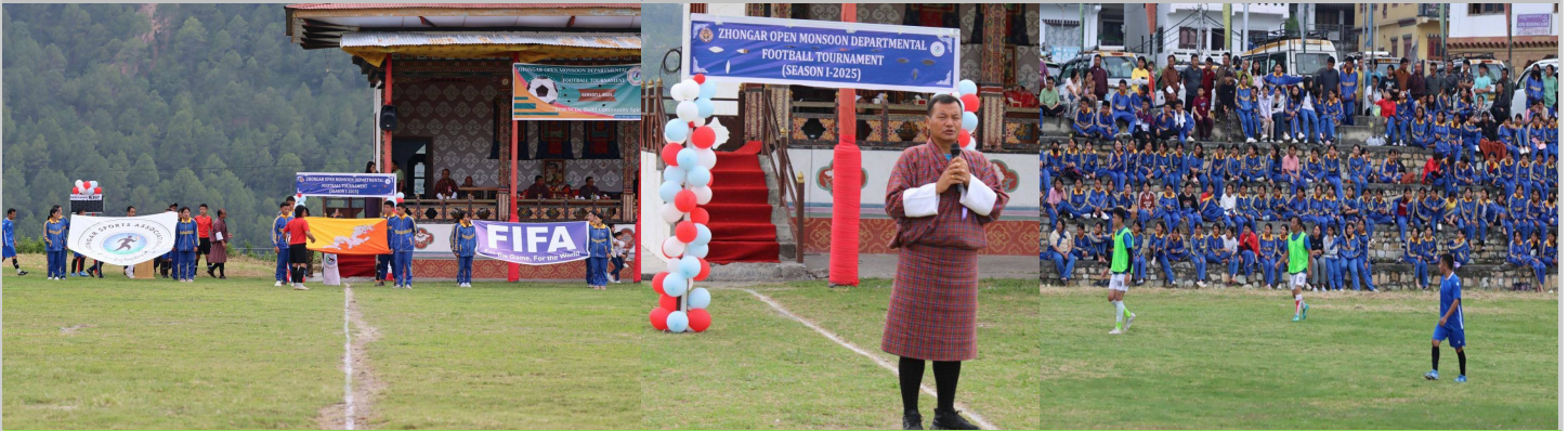
Opening Ceremony of Zhongar Open Monsoon Departmental Football Tournament (Season I)