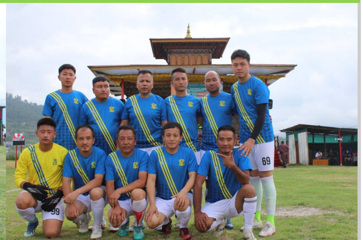
MHSS Giants Team