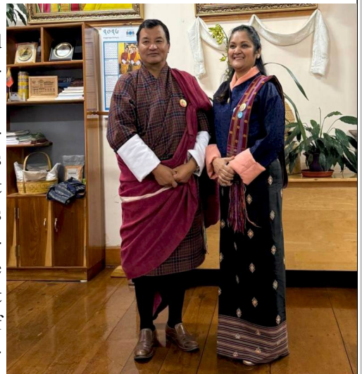
Contributed by: MDA

The Administration remains optimistic about continuing this strong collaboration for the greater benefit of the people of Mongar Dzongkhag.