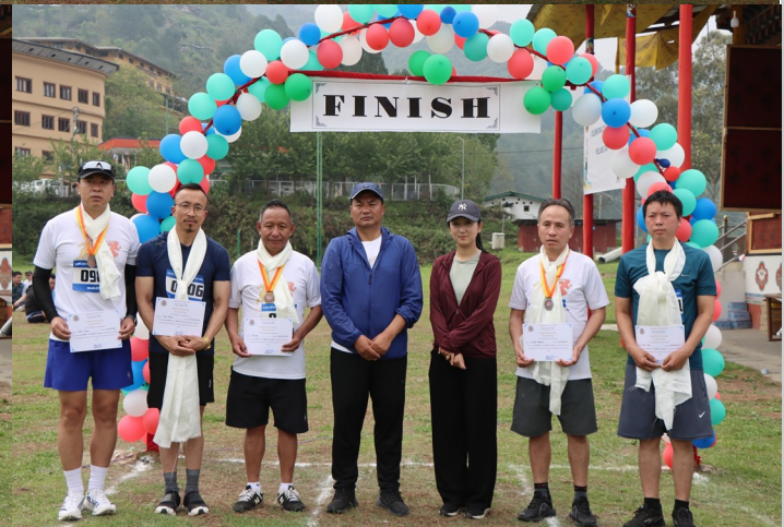
Category (Men)-40 and Above-Winners