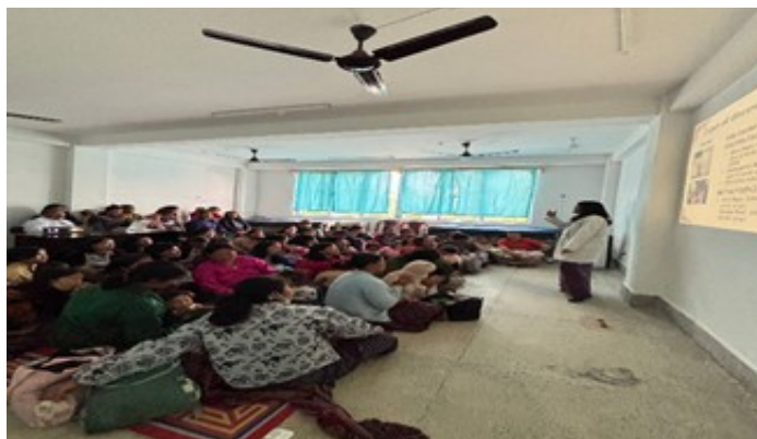
Contributed by: DPHO Office

In addition, awareness on prevention and control of non-communicable diseases (NCDs) was provided. The event also featured wellness activities such as a marathon, health walk, Sorig Zhiney, and aerobic/Zumba sessions to promote overall health and well-being.