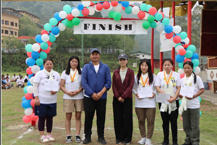
Category (Women)-40 and Above-Winners