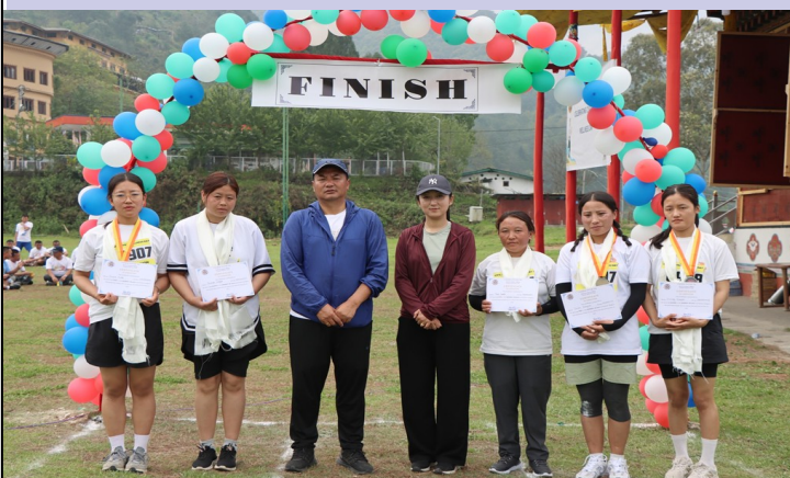
Category (Women)-40 and Below- Winners