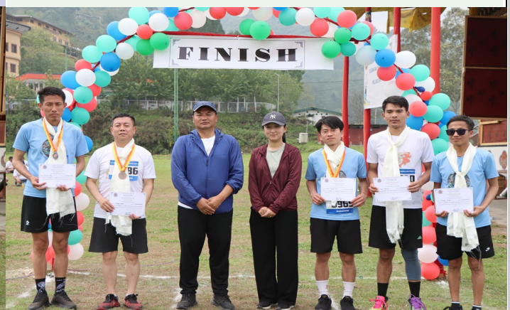
Category (Men)-40 and Below-Winners

Civil Service Wellness Day, Mongar Dzongkhag