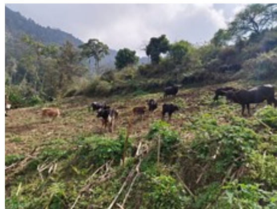
Cattle herd on the hillside terrain of Monggar — diverse landscape

In a proactive endeavour to fortify Monggar's agrarian economy, the Dzongkhag Live-stock Sector has successfully concluded its 2025-2026 FMD and BQHS vaccination mandate. The primary objectives