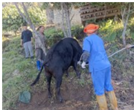
Gewog Livestock Supervisor vaccinating cattle at a farm in Monggar, 2025-26.

In a proactive endeavour to fortify Monggar's agrarian economy, the Dzongkhag Live-stock Sector has successfully concluded its 2025-2026 FMD and BQHS vaccination mandate. The primary objectives