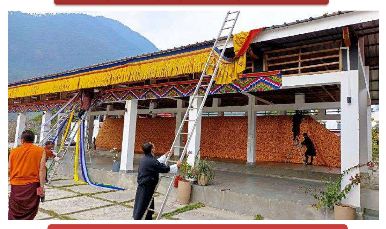
Staff Of Gzhss Engaged in Enhancing the Ambience of Venue