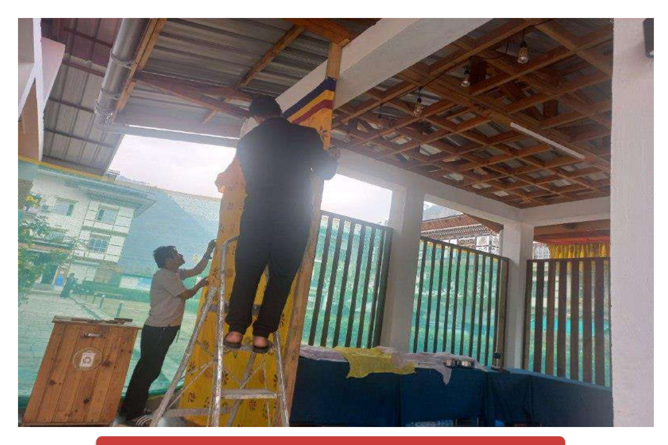
A partition being set up for the Serving Team Area