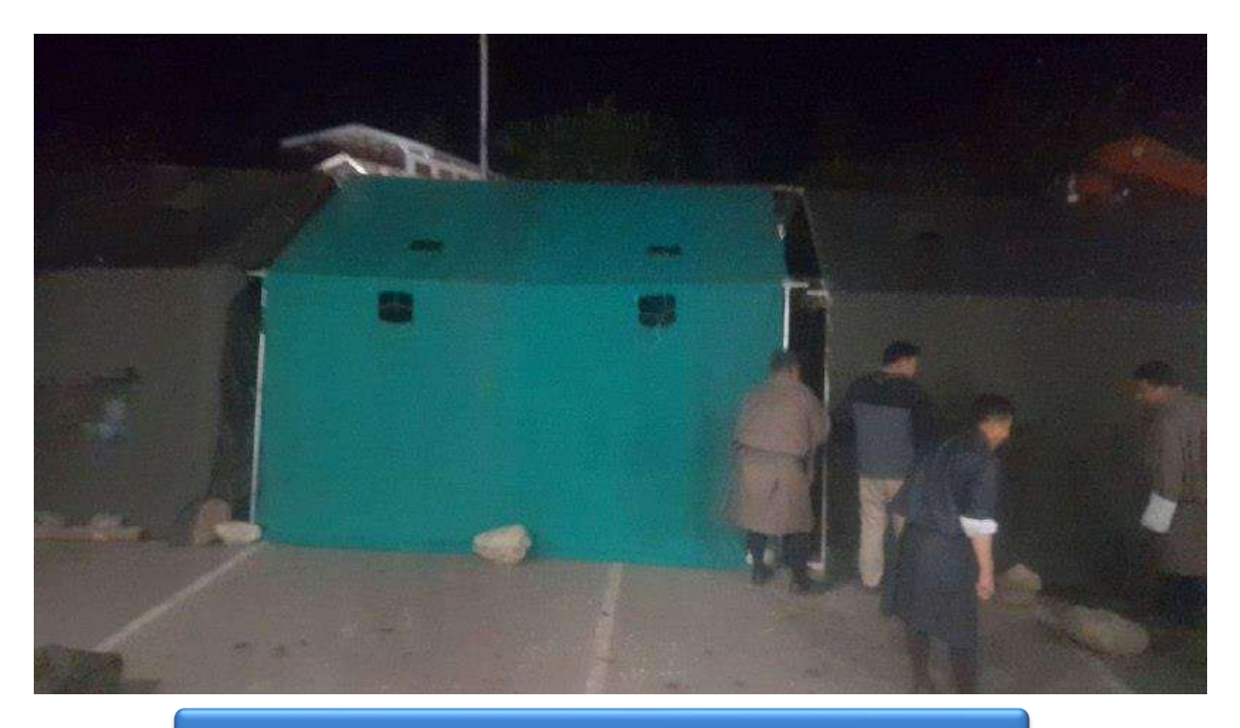
Stalls being set up to please the tastebuds