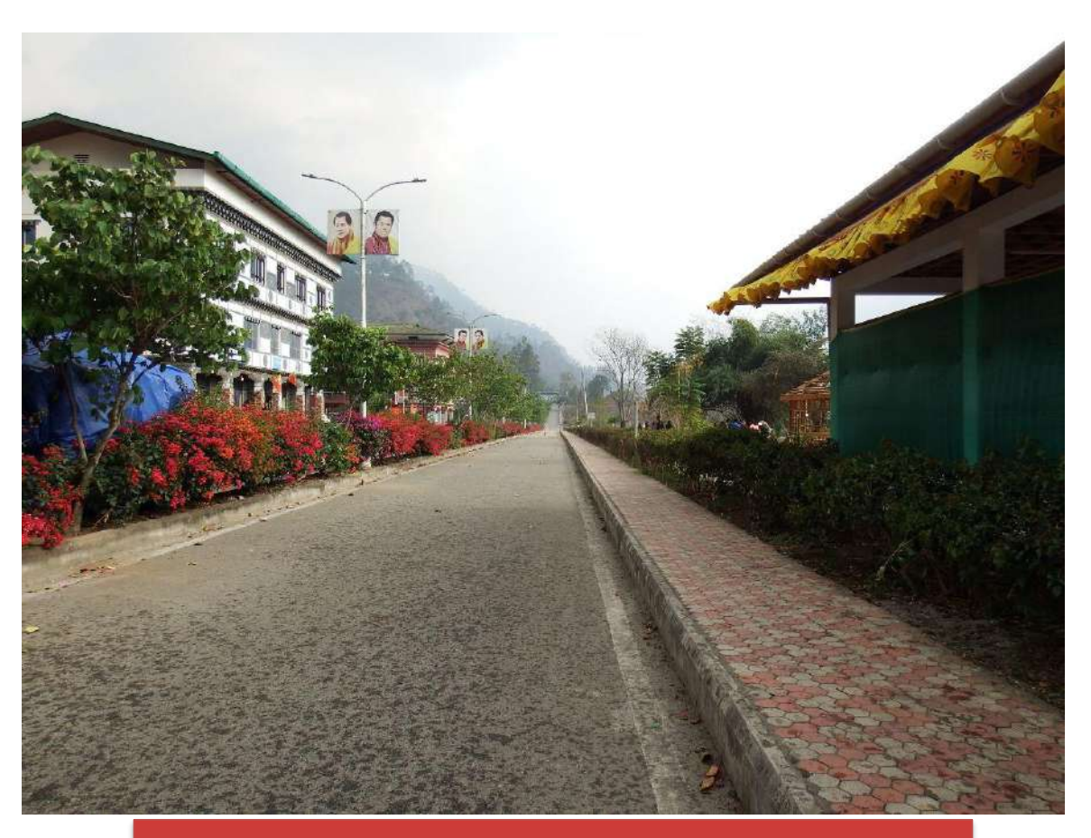
The road without vehicle provided plenty space for people to move around and visit the various stalls set up by locals