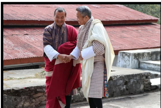
Hon'ble RCSC Commissioner Dasho Baburam Sherpa

On March 7, 2025, the RCSC Commissioner, Dasho Baburam Sherpa and his team met with 75 civil