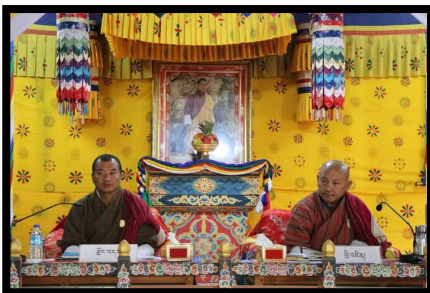
Dzongkhag Tshogdu Thrizin & Dasho Dzongdag

The 7 th session of the Monggar Dzongkhag Tshogdu of the 3 rd Local Government took place from March 10 th