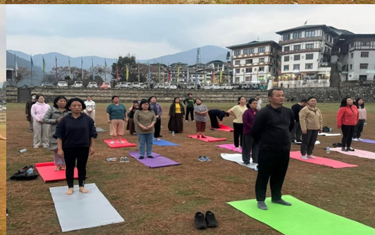
Dasho Dzongdag & Staff participating in aerobic exercise, Zhiney & Luejong Program