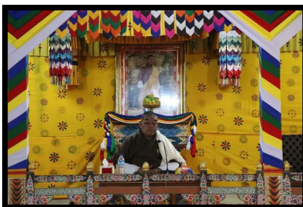
Hon'ble Election Commissioner Dasho Dawa

about the Civic Education Program (CEP).