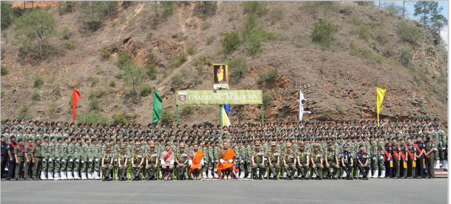
PoP of 2 nd Batch Gyalsung on 23rd March 2025