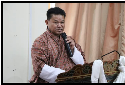
Chief Education Officer, Mongar

The 41 st Dzongkhag Education Symposium on the theme "Excellence in Education Quality and Academic Performance" was conducted from