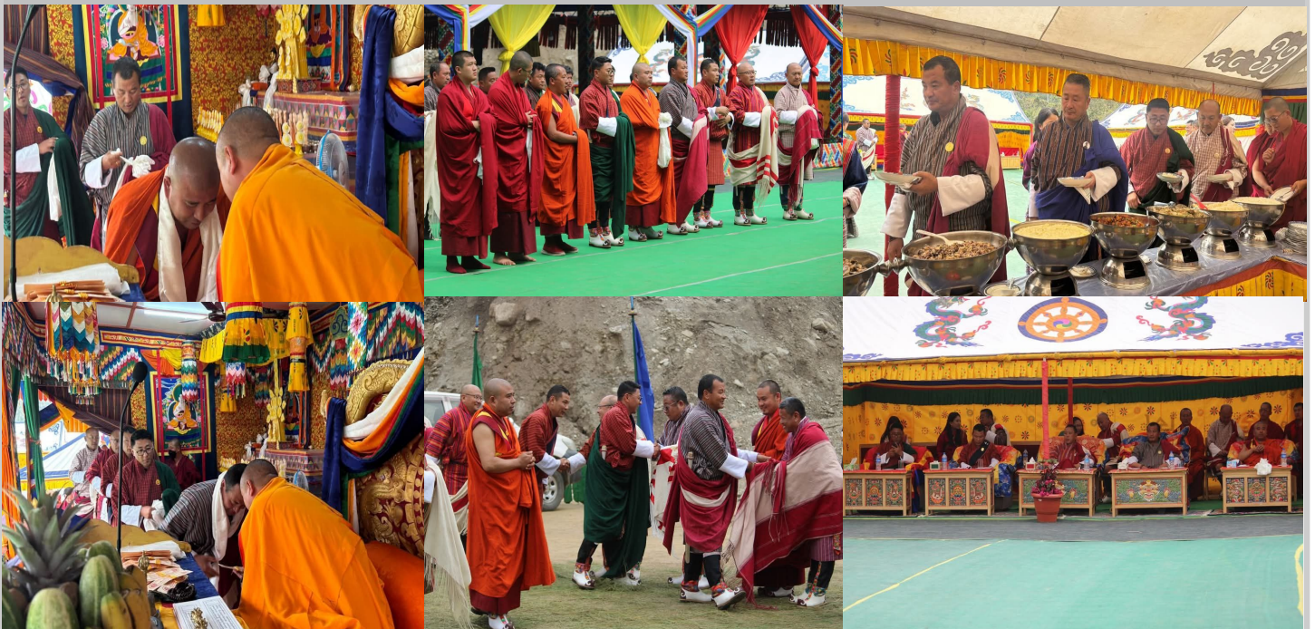
Monggar Dzongkhag Meonlam Chenmo Committee attending Pemagatshel Dzongkhag Meonlam Chenmo