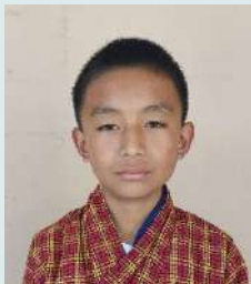
Muensel Loday IX 'B' MHSS