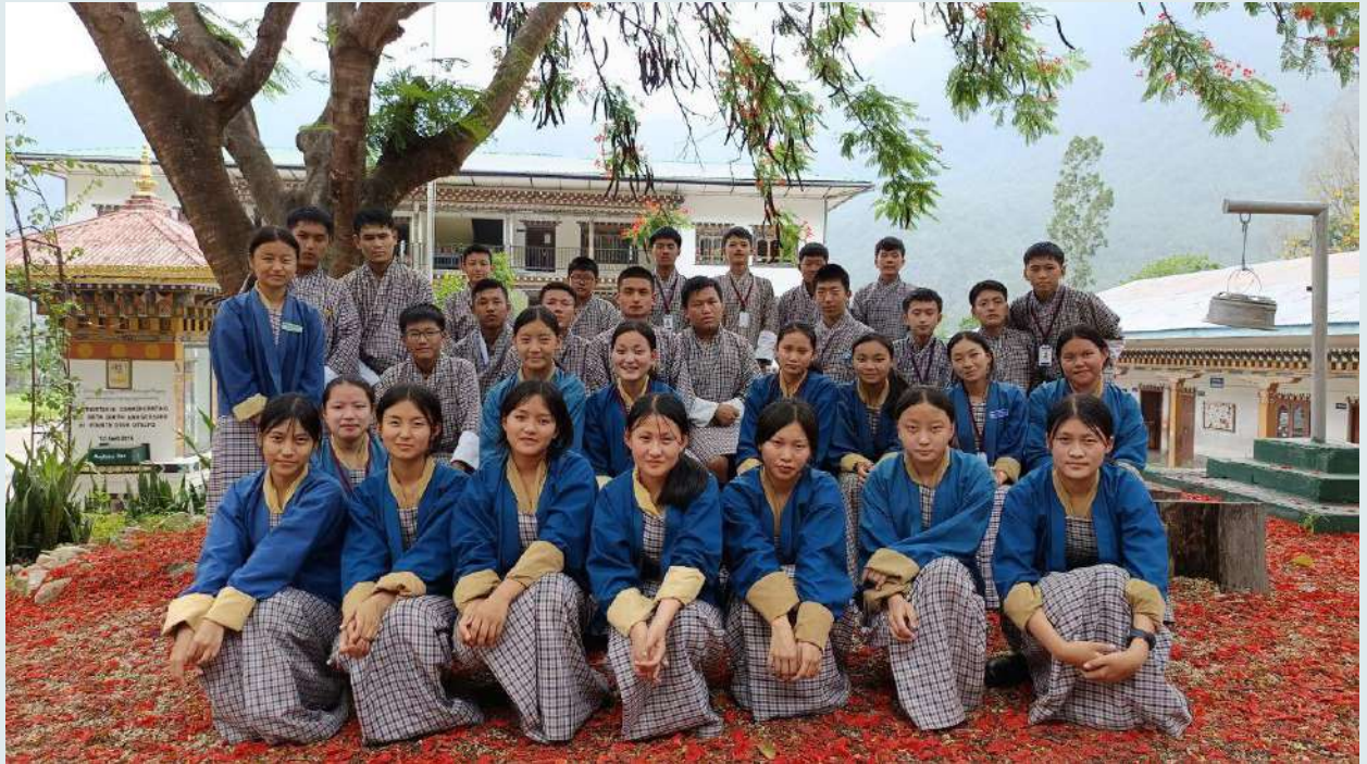
Cultural Group of GzHSS