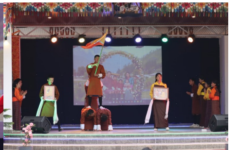
Carnival of Mongar at KaJa Throm, Gyalpoizing