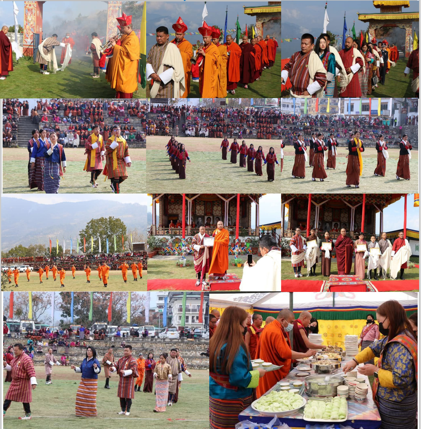
Birth Anniversary of His Majesty The King