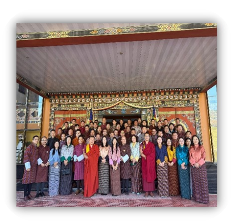
Contributed by: Agriculture Office