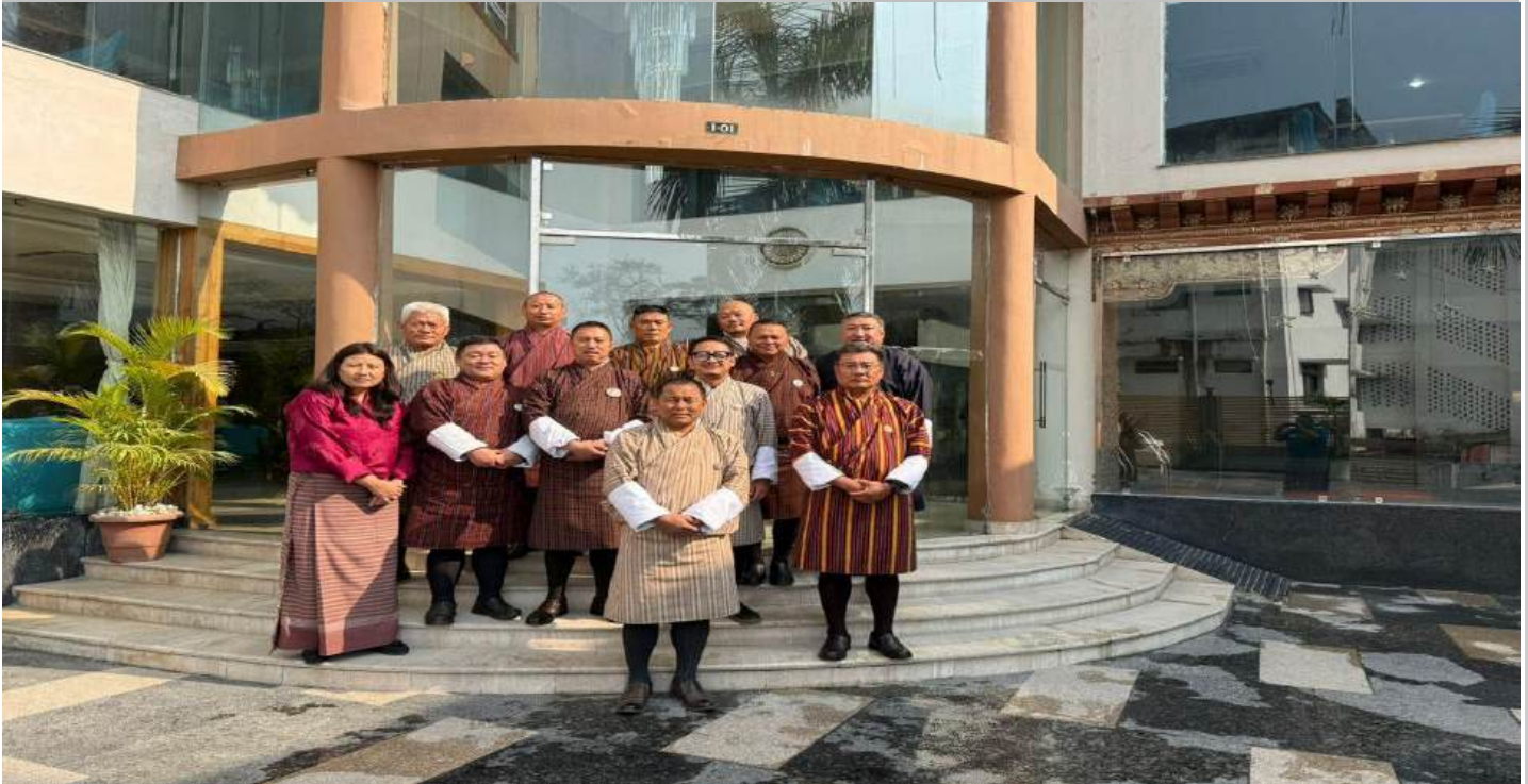
Landscape-level Ecotourism Taskforce (LECT) Meeting