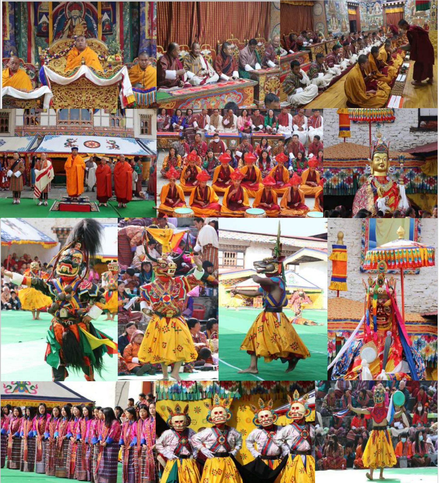
61 st Annual Monggar Tshechu