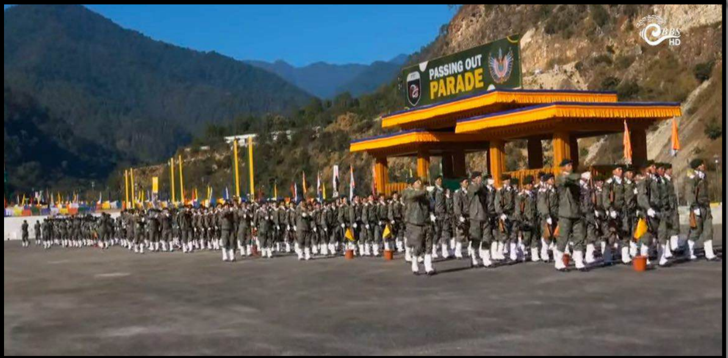
Pop of 1st Batch Gyalsups– Picture from BBS