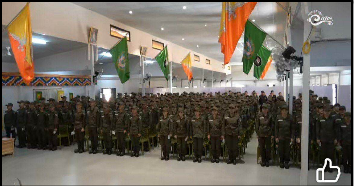
Inaugural of 2nd Cohort of Gyalsung at Bondeyma, Lingmethang