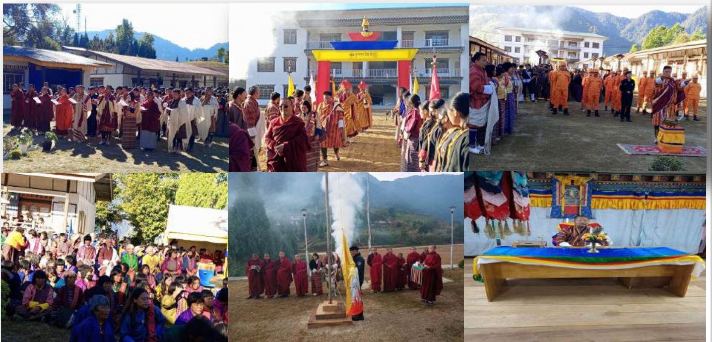
Opening Ceremony of Weringla Drungkhag, 2024