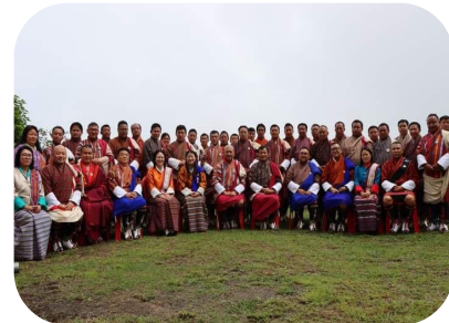
Contributed by: DT Office