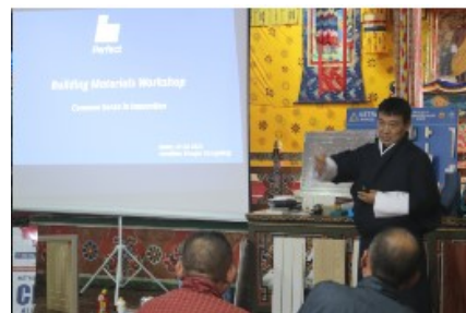
Contributed by: Engineer Office

During this event, the team displayed the perfect building materials, demonstrated how to check and assure the quality of the products, and highlighted the importance of the high-quality materials besides the availability of the budgets. They presented on modern building construction materials like TMT TMX, FRP, roofing materials, uPVC, plumbing materials, concrete add mixtures, electrical materials, WPC, paints, barbed wire, and mesh wire.