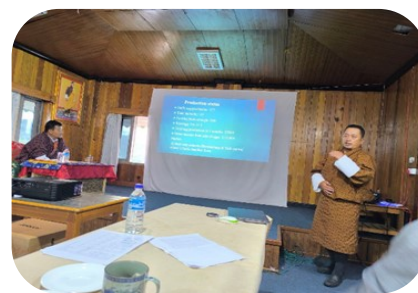
Contributed by: Livestock Office

The meeting concluded with every members present committed to work zealously to implement the 13 th plan successfully.