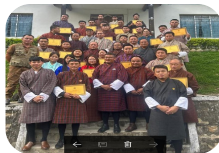
Contributed by: Land Office

trained on developing the new Ref to maintain the precision of cadastral data. There were, 11 participants from the Mongar Dzongkhag.