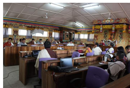
Contributed by: DT Office