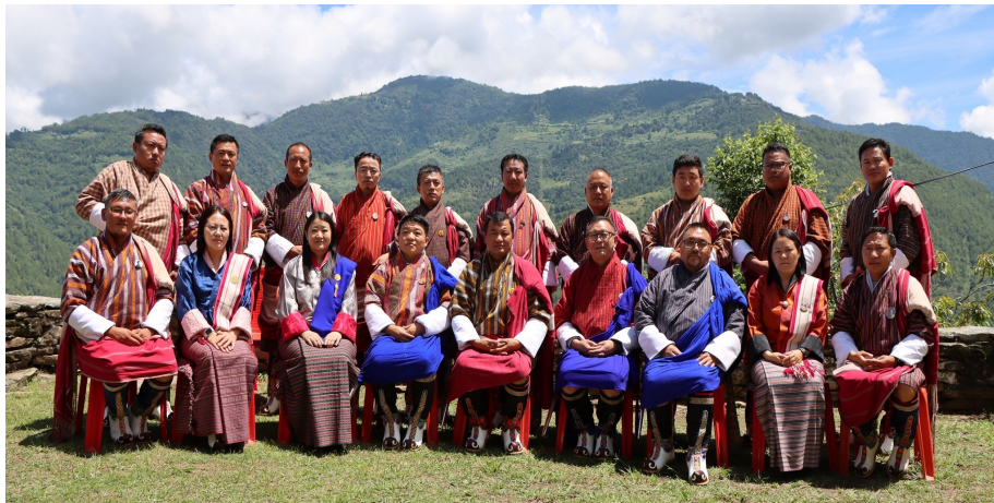
Hon'ble Member of Parliaments and DT members