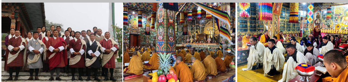
Dzongkhag Officials offered Soeltshog to Kilikhar and Anim Shedras during the Yarney