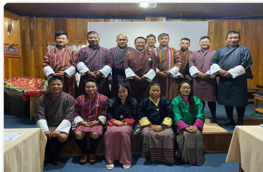
Contributed by: Agriculture Office

khag as well as identify the One Gewog One Product (OGOP) that matches the Gewog selected products. Finally, all field staff's Individual Work Plans (IWPs) were finalized in accordance with the regional plan. It is funded by CARLEP/IFAD.