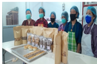
Contributed by: RNR-EC Drameitse

The groups are trained on products processing, namely candy, cookies and bread. The wild apple, amla and persimmon are the primary raw materials used to processed candy. The other raw materials used are flour of maize, finger millet and quinoa to process cookies and bread. The processed candies will be supplied to OGOP, Thimphu.