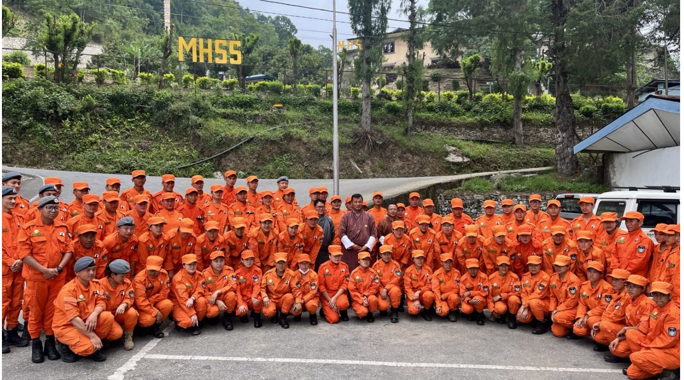
DeSuups before fielding to the gewogs for Million Fruit Tree Plantation.