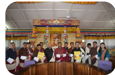
Contributed by: Engineering Office

Dzongkhag Administration formally handed over the GC Road to the Department of Surface Transport, Regional Offices, Lingmethang, Tashigang, and Samdrup Jongkhar. The Handing Taking Over ceremony was carried out in the presence of Dasho Dzongdag on June 28, 2024, and was attended by all the Gups of the 17 Gewog Administrations, as well as officials from the regional offices and the Dzongkhag engineering sector. The timely maintenance of the structures will hereafter be managed by the respective