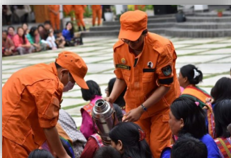
From KaJa Throm Inauguration at Gyalpoizhing on 4 th June 2024.