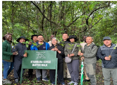
Coffee Plantation Experience

periential tourism within the ecotourism sector under the GEF Ecotourism Project. During the visit, the team engaged in various activities that showcased Uganda's rich natural and cultural heritage. The team participated in guided Mountain Gorilla tracking, Chimpanzee sighting, learning about local conservation efforts and observing the diverse flora and fauna in their natural habitats. The team