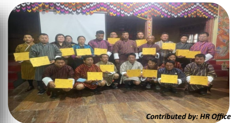
Contributed by: HR Office