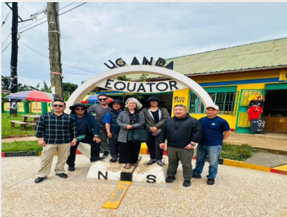
Equator Zero Line

Experiential tourism in ecotourism offers travelers hands-on, meaningful experiences with nature and local cultures. Instead of just sightseeing, visitors engage in activities like wildlife tours, conservation projects, and cultural exchanges with locals. It also supports sustainable practices and provides economic benefits to local communities. By directly interacting with their surroundings, travelers learn the importance of protecting the ecosystems they explore, making their trips more rewarding and responsible.