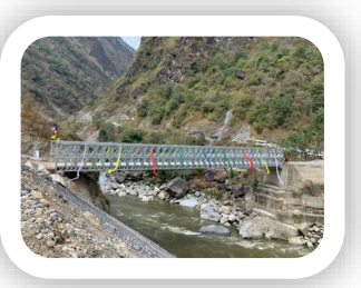
Contributed by: Dzonadaa Office

bridge's sanctity. The new 190-foot-long bridge, costing over Nu 30 M, boasts a load capacity of 40 MT. BCTA and DoST will enforce load restrictions to ensure safety, with plans for a vehicle weigh bridge. 27th June The bridge revitalizes busi-