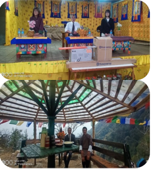
Contributed by: DTS Office

participation, chiwog zomdu, and strategies to promote income generation within the communities. Of particular note was the discussion surrounding an upproject coming titled "Promoting Inclusive Community Participation Leveraging CEP," which was highlighted by the visiting team.